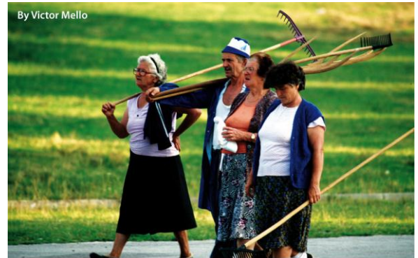
By Victor Mello

In particular, it would be enough to use better the ordinary funds for development which are often attributed today to centralized, fragmentary and not very effective interventions, at least in part. The core idea is illustrated in the attached Manifesto of KIP Pavilion Partners, which contains various subjects in favor of this kind of democratic revolution of development and cooperation.