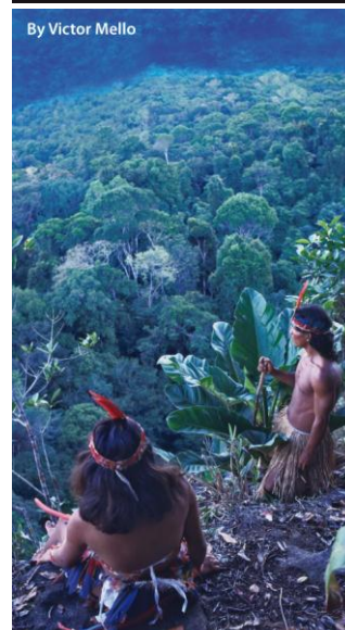
By Victor Mello

KIP INTERNATIONAL SCHOOL KNOWLEDGE, INNOVATIONS, POLICIES AND TERRITORIAL PRACTICES FOR THE UNITED NATIONS MILLENNIUM PLATFORM