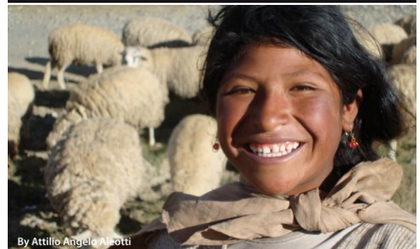
By Attilio Angelo Alzotti

KIP INTERNATIONAL SCHOOL KNOWLEDGE, INNOVATIONS, POLICIES AND TERRITORIAL PRACTICES FOR THE UNITED NATIONS MILLENNIUM PLATFORM